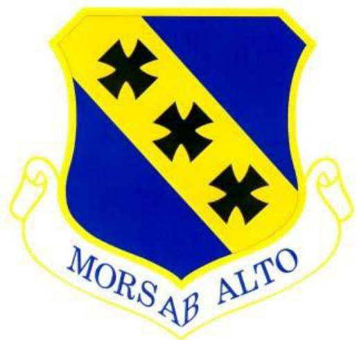
Figure 1b Emblem, 7 th Bomb Wing

A. Figure 1a provides a historical example of a shield, crest, and scroll. The crest is any device displayed above the shield, and it is placed over a wreath of six skeins or twists composed of the principal metals (gold and silver) and colors of the shield. The metals and colors appear alternately in the order named in the blazon. The scroll is the third element in a military coat of arms and is usually inscribed with a motto and placed beneath the shield.