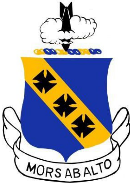
Figure 1a Emblem, 7 th Bombardment Group

arrangement and colors of the design on the shield, crest, or scroll. The shield (either heater shaped or circular) is used for displaying armorial bearings in Air Force Heraldry as an identifying mark for an organization. The charges, or figures, that form a coat of arms are emblazoned on the surface of the shield, called the field.