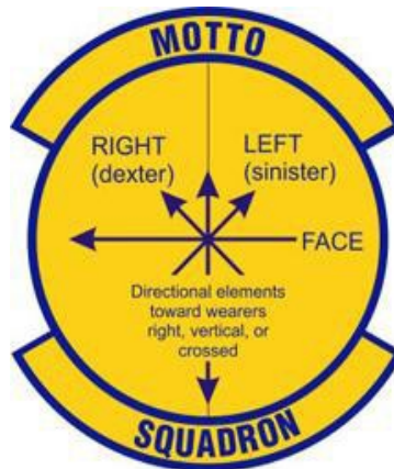
Figure 7 Emblem for Squadrons and Equivalent

that over time as the support units requested official heraldry actions, AFHRA, along with the MAJCOM history offices, were to review the support unit emblems for compliance with the more rigid design standards he had put in place. He charged AFHRA to enforce the stricter standards and to have modified those support unit emblems whose emblems were non-compliant. The review of support unit emblems for compliance continues to this day.