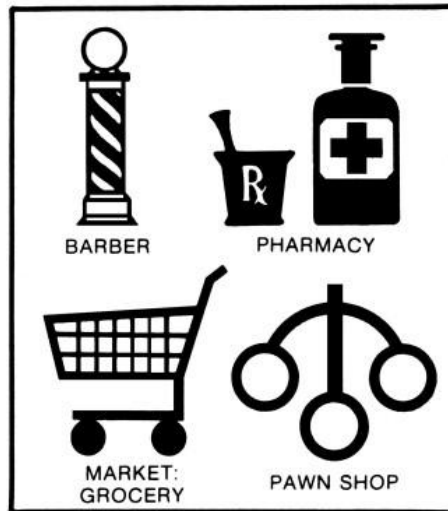
Figure 2 Common Symbols