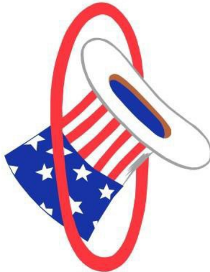
Figure 6 Emblem, 94th Aero Squadron

1. A system of heraldic emblems evolved within the air arms of the allied and central powers during World War I, the first major conflict in which the newly-developed airplane became an instrument of war. On 6 April 1917, America declared war on Germany, and, shortly thereafter, Brigadier General Benjamin D. Foulois became Chief of the Air Service, American Expeditionary Forces (AEF). A year later, on 6 May 1918, Foulois established the policy for insignia of aerial units, declaring that each squadron would have an official insignia painted on the middle of each side of the airplane fuselage. "The squadron will design their own insignia during the period of organizational training. The design must be submitted to the Chief of Air Service, AEF, for approval. The design should be simple enough to be recognizable from a distance." 3