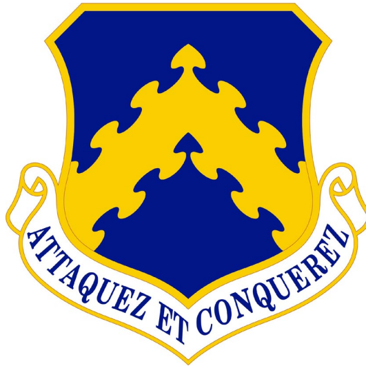
Figure 11 Emblem, 8th Fighter Wing

4. The current shield has only one scroll, as shown in Figure 11. The scroll usually displays an establishment's designation. But a wing or independent group (i.e., a group assigned to an echelon at a higher level than a wing) may choose to display its approved motto on the scroll (DAFI 84-105 paragraph 3.3.2.). Either way, the flag-bearing organization must limit the number of characters (letters and numbers) and spaces to 36. To contrast with the flag field, the scroll must be white with a yellow border and blue lettering. When the scroll must be changed because of redesignation or motto change, the establishment requests a change of scroll through history channels (only squadrons and flights may change their scrolls locally). If Centralized Funding is not available, organizations that have digitized emblems and flag and patch drawings already, TIOH discounts the cost of updated color artwork and drawings. The flag manufacturer must have an updated flag drawing showing the revised lettering to embroider the new scroll for the flag. The flag manufacturer will change the scroll on the organization's existing flag for about a quarter of the cost of a new flag. Contact the Air Force Clothing and Textile Office, DSN 444-3850 or (215) 737-3850, for details.