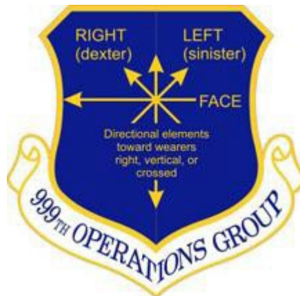
Figure 8 Emblems for Groups and Above (Flag-bearing Organizations)

7. The emblem design for units must be on a circular shaped shield or disc, as illustrated in Figure 7 DAFI 84-105, paragraph 3.4). Units with emblems on discs include named and numbered squadrons, numbered flights, and other USAF organizations that have no headquarters component.