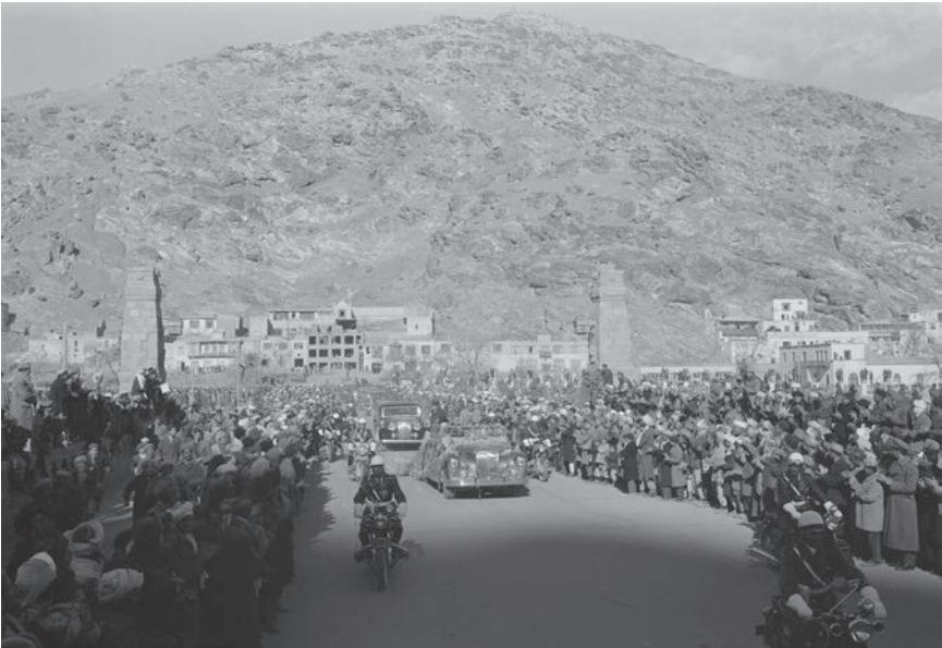
Thousands of Afghans lined the roads to see the motorcade that carried President Eisenhower into Kabul. He later wrote that “I was heartened to see such spirit in people of whose sympathies we had been doubtful.”

and strengthening of good relations with friendly States. Efforts are being made to establish and strengthen these ties with all the peoples and nations of the world.” 39 He then embarked on a two-year campaign to engage U.S. leaders at the highest level of government and demonstrate Afghanistan’s political and economic independence from the Soviet Union. 40