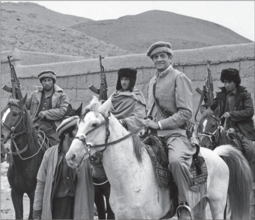
U.S. Congressman Charles N. “Charlie” Wilson (D-TX), who worked with CIA operatives to have Stinger missiles provided to the Afghan resistance, is shown in a personal photo with mujahideen fighters in Afghanistan.

Affairs John H. Kelly released a statement in March 1990: “We believe that no stable political settlement is achievable as long as the Najibullah regime remains in power. The Resistance is both united and passionate on this point: a transfer of power away from the present regime and to a new government is necessary for this chapter, with all its attendant tragedy, to be brought to a close.” 71 In September 1991, U.S. secretary of state James A. Baker III and Soviet foreign minister Boris N. Pankin released a joint statement agreeing on the cessation of hostilities, support for elections during the transition period, the repatriation of refugees, and the prompt reconstruction of Afghanistan. Both parties pledged to cut off arms supplies by January 1, 1992. 72