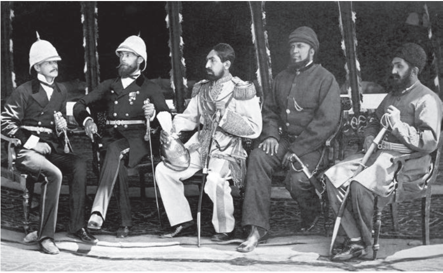
Mohammad Yaqub Khan (center) at Gandamak, a village outside of Jalalabad, during May 1879 negotiations that resulted in the Treaty of Gandamak, the document that outlined what became the Durand Line. To his right is Maj. Pierre Louis Cavagnari, who became British Resident in Kabul and was killed by mutinous Afghan troops in September 1879.