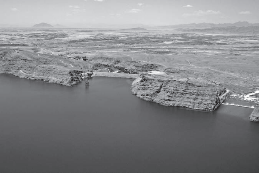
Kajakai Dam, on the Helmand River, is the largest dam in Afghanistan. It was completed in 1953 by Morrison-Knudsen Afghanistan. USAID began installing hydroelectric power stations in 1975, units that became U.S. bombing targets in 2001. They were subsequently restored, and development efforts on and associated with the dam have been a major focus in the 2000s. It is shown from the reservoir side in a 2012 image, with the spillway to the right.

and could not overcome a lack of appreciation of this “America in Asia” project. 13