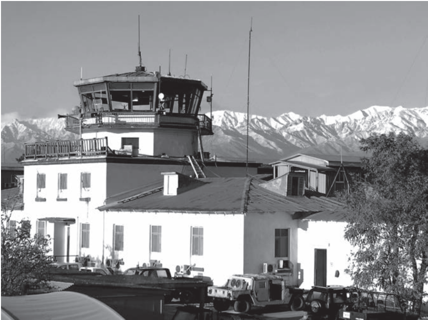
The Soviets built this control tower at Bagram air field in 1976 as their involvement in Afghanistan began to intensify. It was heavily damaged during the civil war, but after U.S. troops took control of the base in late 2001, the U.S. Air Force renovated the facility and used it until a new tower was completed in 2008. The building remained in service, housing Air Force units as part of Camp Cunningham.

the downfall of [Daud], it was accomplished by a small number of military men . . . at the air base side of Kabul International Airport. Only some 600 men, 60 tanks and 20 warplanes were involved in approximately nineteen hours of rebel action against the more numerous loyalist forces.” 12 By the morning of April 28, Daud and his brother Mohammad Naim Khan were dead, and new rulers controlled Kabul.