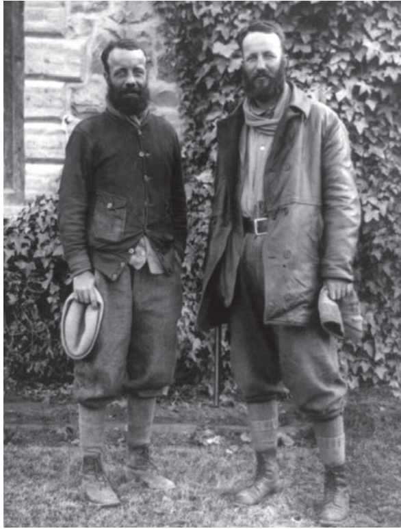
Kermit and Theodore Roosevelt Jr. during their 1925–26 expedition in South Asia. They observed that “the Afghanistan route was very difficult, and the natives uncertain, to put it mildly.”

Despite U.S. apprehension, Afghan desire for formal diplomatic relations never waned. Mohammad Zahir Shah framed a letter to President Franklin D. Roosevelt in April 1934 with the opening remarks, “My Dear and Most Honoured Friend: In view of the friendship and goodwill, which, since the extraordinary embassy of Afghanistan of 1921, are established between the two great States of Afghanistan and the United States of America.” Zahir Shah informed Roosevelt that his father had died and that he had ascended the throne. He continued, “We are pleased to notify the desire of the Afghan Government to strengthen the political and economic relations, which he had and has still now with the High Government of the United States.” 7