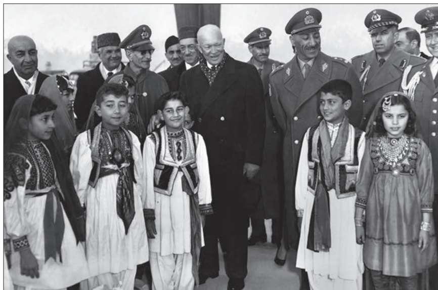
President Dwight D. Eisenhower received a royal welcome at Bagram air field in December 1959. Dignitaries included the king, Mohammad Zahir Shah ( right of Eisenhower), and Prime Minister Mohammad Daud Khan ( far left).

In the late 1950s, Zahir Shah intensified his diplomatic profile in the world and promoted his bi-tarafi (literally “without sides,” or nonaligned) philosophy. 38 As he stated during Afghan Independence Day celebrations in 1957, “The country’s foreign policy is based on the continued safeguarding