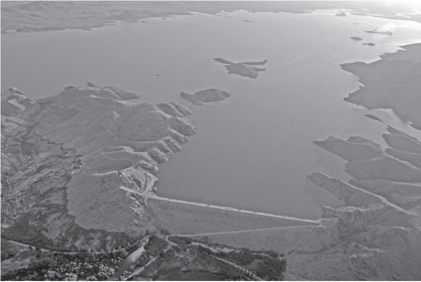
Dahla Dam on the Arghandab River north of Kandahar was completed in 1952 and originally known as the Arghandab Dam. It was built by Morrison-Knudsen Afghanistan, a subsidiary of the American firm that had built the Hoover Dam, among other large-scale projects.

Minister Shah Mahmud Ghazi Khan wrote in 1946: “America’s attitude is our salvation. For the first time in our history, we are free of the threat of great powers’ using our mountain passes as pathways to empire. Now we can concentrate our talents and resources on bettering the living conditions of our own people.” He continued: “I propose to reduce the army in size to that of a small but well-trained internal security force charged with maintaining order among the nomadic tribesmen. Money once used in maintaining a large army will find better use in the already started national improvement program.” 5