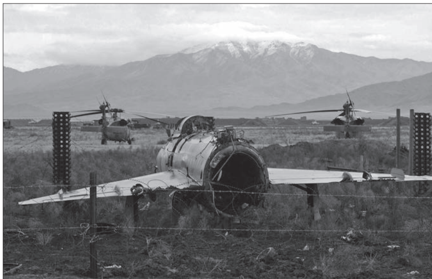
The remains of a Soviet aircraft (probably a MiG-21) at Bagram air base outside Kabul, February 2002, with U.S. Army UH-60 Black Hawk helicopters in the background. The Soviets took control of the air bases at Bagram and Shindand in the summer of 1979.

In August 1979, Gen. Ivan Pavlovskii, deputy minister of defense and commander in chief of Soviet ground forces, led a sixty-three-person Soviet military delegation, including eleven general officers, to evaluate the crisis in Afghanistan. When Pavlovskii returned to Moscow in November, he advised against military intervention. Consensus within the Politburo to invade was building, however. Taraki and Amin made at least sixteen formal requests for Soviet troops between mid-April and mid-December 1979, reinforcing the push in Moscow for intervention. 35 Three key Soviet officials in Kabul—the Soviet Ambassador to Afghanistan, Alexander