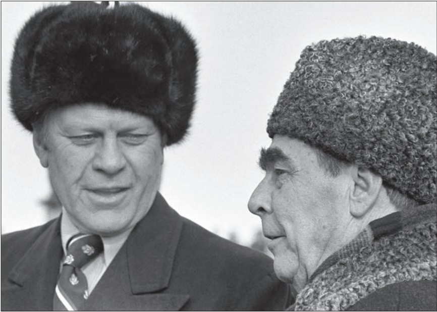
Soviet leader Leonid I. Brezhnev (right) with President Gerald R. Ford during a summit meeting in Vladivostok, USSR, in November 1974. Brezhnev concluded a treaty with Afghan leaders in December 1978 that closely linked Afghanistan with the Soviet Union.