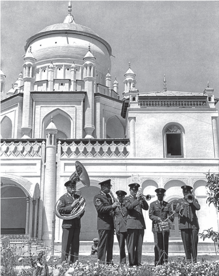
A dixieland combo of the U.S. Air Forces in Europe Band's Ambassadors jazz ensemble plays outside the mausoleum of Abdur Rahman Khan in Kabul in 1968. The group was in Afghanistan to perform at the Jeshyn Fair, an event celebrating that country's independence. USAF in Europe Band.

build a secret base for U-2 aircraft, located at the Peshawar Air Station in Badaber, Pakistan. 36 The base was also used by the 6937th Communications Group, U.S. Air Force Security Service, for a communications link between Karamursel, Turkey, and Peshawar, Pakistan. 37 Understanding the importance of the U-2 base in Peshawar to the United States, Pakistani officials leveraged the issue. 38 According to one analysis in 1964, "The