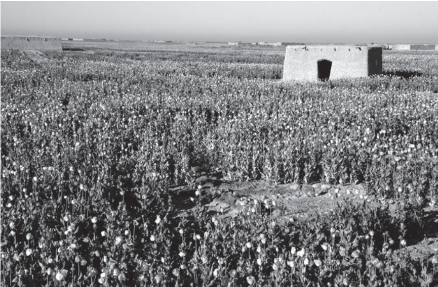
An opium poppy field in the Marja district of Helmand Province. The Taliban, almost from its inception, was dependent on the drug trade and built a strong network in this region.

Direct Russian support for the Afghan government ended with the rise of the Taliban in 1994. After this point, the Russian government engaged in complex proxy battles in a new phase of the Afghan civil war alongside other regional powers, including Pakistan, India, Iran, Saudi Arabia, and Uzbekistan. Faced with the prospect of Islamic revolution in Central Asia, the Russian government began to support militias with anti-Soviet pasts. In 1996, Massoud and Dostum, two former rivals, joined to resist the growing Taliban threat and formed the United Islamic Front, also known as the Northern Alliance. Massoud had played a major role in the resistance against the Soviet Union during the 1980s, earning him the distinctions the “Lion of Panjshir” and the “Afghan who won the Cold War.” Dostum, considered the leader of Afghanistan’s Uzbek community, had fought on the Soviet side until the collapse of Najibullah’s government in 1992 and shifted alliances on several occasions thereafter. This pair and their forces proved little match for the well-equipped Taliban. 14