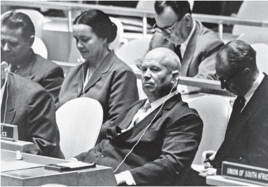
Soviet leader Nikita S. Khrushchev at a meeting of the United Nations General Assembly in New York, September 1960. His open support of Afghanistan on the Pashtunistan issue created challenges for the United States in its relations with both Afghanistan and Pakistan.

where pro-Afghan and pro-Pakistan groups had escalated hostilities. Prime Minister Daud met with Ambassador Byroade and indicated that Afghanistan would be forced to protect local tribes if Pakistani troops quelled the violence. 31 From the Afghan point of view, the Durand Line was not an issue since local tribes did not observe the international boundary of Afghanistan and Pakistan. Instead, Daud focused discussion on the fact that Afghanistan supported Pashtun tribes irrespective of their location. 32 A month later, President Eisenhower informed Mohammad Zahir Shah that the United States would not mediate and expressed hope that Afghanistan and Pakistan would engage in bilateral negotiations to resolve their conflicts. 33 The Soviets exacerbated the situation again in March 1961 when Khrushchev publicly declared that “Pashtunistan has always been part of Afghanistan.” 34 Tensions continued to mount until September 3, 1961, when Afghanistan closed its border and Pakistan shut Afghanistan’s consulates. The borders remained closed until May 29, 1963.