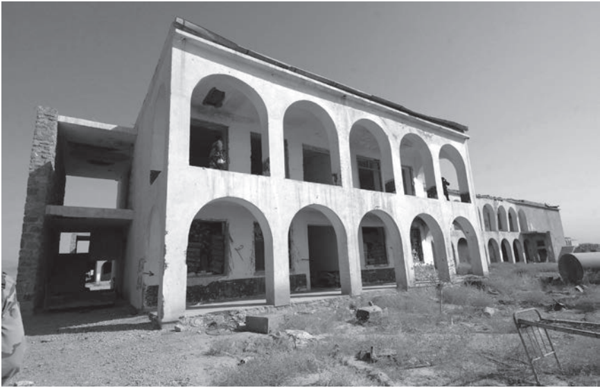
As the war progressed, the Soviets built training facilities in Afghanistan, such as this one north of Kandahar. It later became a Taliban base. It is shown in a 2005 photo after U.S. forces captured the camp.