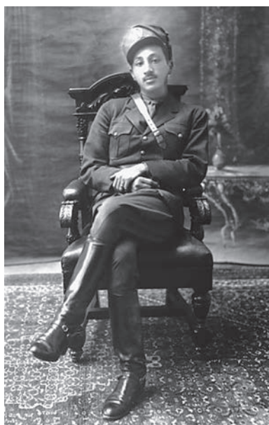
Mohammad Zahir Shah in the early 1930s. He became king in 1933 at age nineteen after the assassination of his father, Mohammad Nadir Shah. Zahir Shah reigned for forty years, then lived in exile in Italy after being deposed in 1973.

Afghanistan embraced a more globalized outlook before World War II, becoming a member of the League of Nations on September 27, 1934. On July 8, 1937, Afghanistan joined Iran, Iraq, and Turkey to sign the "Eastern Pact of Friendship and Nonaggression," also known as the Saadabad Pact, which established the inviolability of mutual frontiers and abstention from interference in each other's internal affairs. 43 In seeking these alliances, Afghan leaders positioned themselves as a political force in the Middle East. 44 They also affirmed their diplomatic independence, which had been constrained for a century by the Great Game. On November 6, 1941, as the growing war became more widespread, the Grand Assembly released this statement: