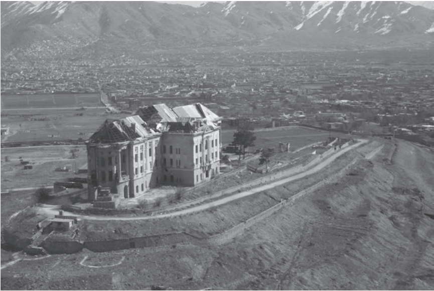
Tajbeg Palace, on a hillside overlooking Kabul. The Soviets stormed it in December 1979 and killed Afghan president Hafizullah Amin. The structure became the staff headquarters for the Soviet Fortieth Army during the occupation. Also known as the Queen’s Palace, it was built in the 1920s for Queen Soraya in conjunction with the construction of Darul Aman Palace for Amanullah Khan (see p. 21). Like that structure, Tajbeg Palace was heavily damaged during the fighting in the late 1980s and 1990s.

Khan, later an influential mujahideen and governor of Herat, led a revolt of the 17th Infantry Division in Herat against the PDPA and Russian advisors based there. This revolt was unique in that power fell entirely into the hands of local insurgents. 27 According to press reports, mutineers went door to door hunting and executing Soviet advisors. Dissidents cut telephone communication, blocked the road from Kandahar to Herat, closed Shindand air base, and attacked Soviet citizens for ten days until armored Afghan military units arrived and Soviet MiGs carried out air strikes in Herat. 28