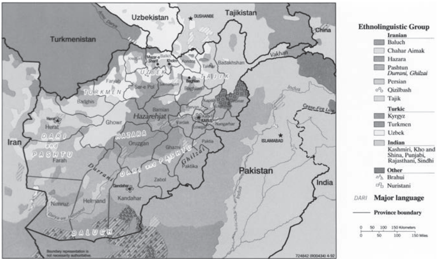
A Central Intelligence Agency map of ethnolinguistic groups in Afghanistan as of 1992, based on data collected by the U.S. Bureau of Census.

and later Pakistani—Afghanistan emerged as a confederation of tribes with a developing national identity.