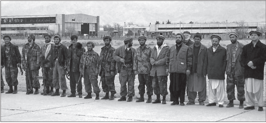
Northern Alliance troops, who fought with U.S. forces against the Taliban in the early stages of Operation Enduring Freedom, at Bagram air base to greet U.S. secretary of defense Donald H. Rumsfeld, December 16, 2001.

monosyllabic millionaire with the open checkbook who had first visited Pakistan in the early 1980s would, by the middle of the decade, launch an ambitious plan to confront the Soviets directly inside Afghanistan with a group of Arabs under his command. That cadre of Arabs would provide the nucleus of al-Qaeda.” 16 While the Saudis had cut off his wealth in Sudan, bin Laden benefitted from his return to Afghanistan, forging a mutually advantageous relationship that drew upon Arab financial contributions to the Taliban in the Afghan civil war and buttressed the Taliban’s international reputation. 17