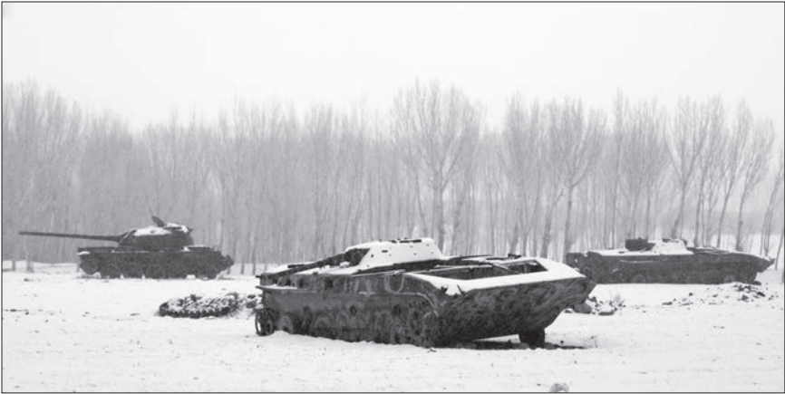
Abandoned Soviet tanks in Bamyan Province. The Russians left a tremendous amount of matériel when they withdrew from Afghanistan in 1989, finding it impractical to transport it back across the Hindu Kush.

have seriously misjudged our own nation's strength and resolve and unity and determination and the condemnation that has accrued to them by the world community because of their invasion of Afghanistan." 44 The United States halted grain exports to the Soviet Union and led a boycott of the Summer Olympics in Moscow in 1980. 45 Brzezinski told the president that, with American help to Afghan forces, the Soviets might become ensnared in Afghanistan the way the United States had been in Vietnam. 46 The Reagan administration expanded this effort. In the early 1980s, Central Intelligence Agency (CIA) director William J. Casey developed a wide-ranging international coalition to fund and train the mujahideen movements. 47