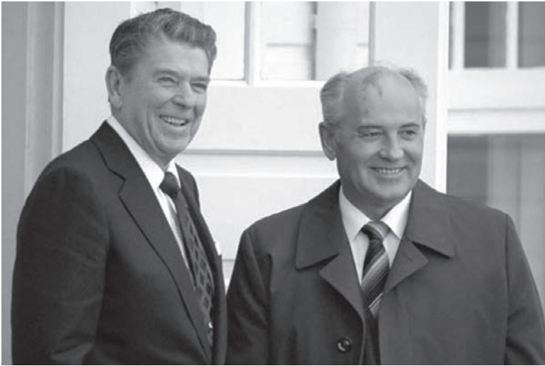
President Ronald W. Reagan with Soviet leader Mikhail S. Gorbachev at a summit in Reykjavik, Iceland, in October 1986. Gorbachev ultimately made the decision for the Soviets to withdraw from Afghanistan, beginning in 1988.

The conflict resulted in inestimable damage to Afghanistan's already poor infrastructure and economy. By January 1980, growing unrest had driven more than 400,000 Afghan refugees to Pakistan and more than 30,000 to Iran. 56 On "Afghanistan Day," March 21, 1982, President Reagan implored: