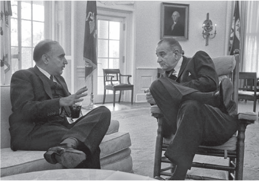
Prime Minister Mohammad Hashim Maiwandwal of Afghanistan in Washington, DC, in 1967 at the White House with President Lyndon B. Johnson.

Pakistani President knows that the strongest card he holds is the U.S. communications facilities at Peshawar. . . . He almost certainly calculates that closing the facilities would bring a drastic reduction in the U.S. military and economic assistance on which Pakistan is so heavily dependent and for which there is no alternative in sight.” 39 At the same time, the border closing placed increased pressure on U.S. aid programs to Afghanistan. The Afghan government requested an alternate transportation route through Iran, but the United States preferred the less costly passage through Pakistan and decided to wait. U.S. policy makers continued to make their Afghanistan policy conditional upon improved relations with Pakistan and hoped for a resolution to the differences.