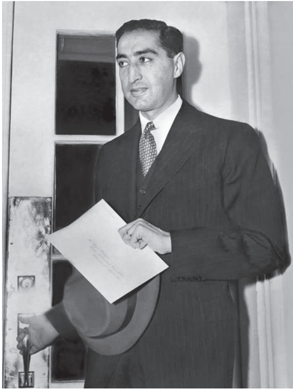
Prince Mohammad Naim arriving at the White House in 1948 to present his credentials. U.S. diplomats saw Naim, the king's cousin and Mohammad Daud Khan's brother, as the most pro-American of the senior Afghan officials.