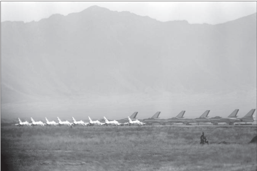
Soviet-built Bagram air field during President Eisenhower’s visit, with Soviet-provided MiG-15s to the left and Il-28 bombers to the right.

[We] experienced for the first time in the tour the excitement of a mob bursting out of control. Suddenly, and without warning, we found our vehicles unable to move, almost sinking in a sea of strange faces. But the faces were friendly in spite of the inconvenience and unavoidable delay; I was heartened to see such a spirit in people of whose sympathies we had been doubtful. 49