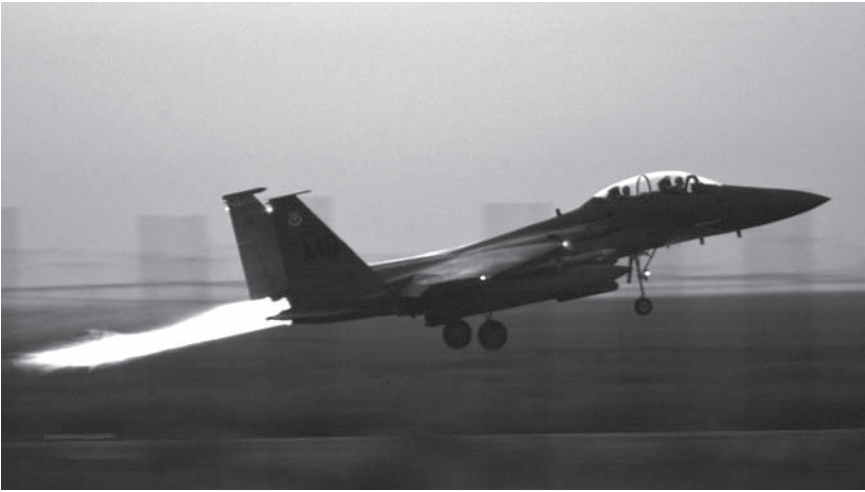
A U.S. Air Force F-15E Strike Eagle from the 332d Air Expeditionary Group takes off for a mission over Afghanistan during the early stages of Operation Enduring Freedom, November 7, 2001.