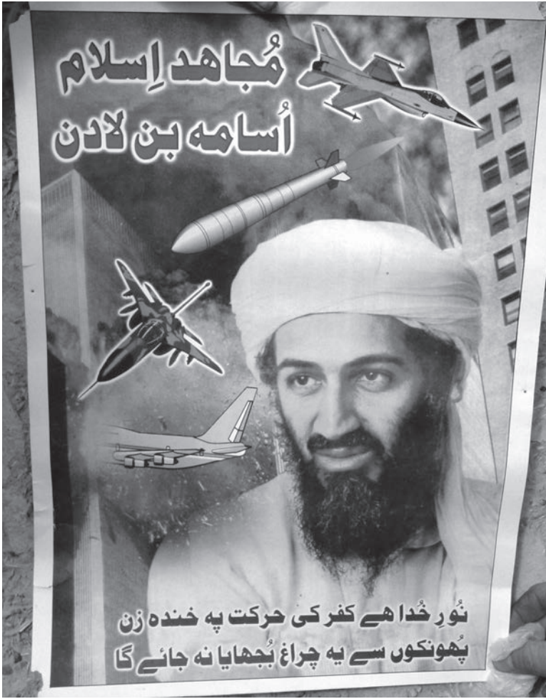
A propaganda poster, found by U.S. troops in 2002, showing al-Qaeda leader Osama bin Laden. The architect of the 9/11 attacks was killed in Pakistan in 2011 by U.S. Special Forces.

terrorists launched an assault on the United States that led to direct U.S. military engagement in Afghanistan.