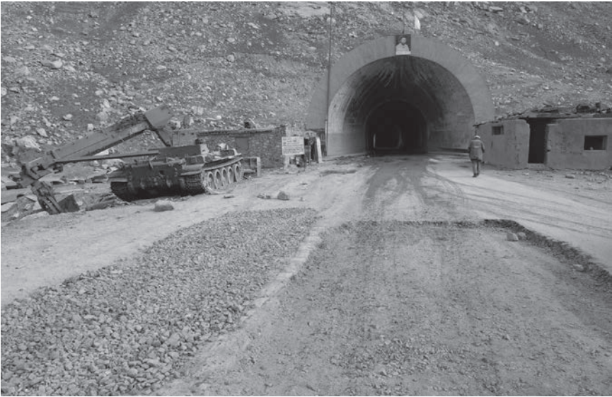
The Salang Tunnel, two miles above sea level through the Hindu Kush, connects Afghanistan with Central Asia. It was built with the Soviet aid that started in 1955, with the tunnel opening in 1964. In this 2002 image of the Baghlan Province entrance, an abandoned Soviet IMR combat engineering vehicle can be seen to the left.

“The amount of money we spent in gratuitous assistance to Afghanistan is a drop in the ocean compared with the price we would have had to pay in order to counter the threat of an American military base on Afghan territory.” 18 The Soviets also renewed the 1931 Soviet-Afghan Treaty of Non-Aggression and agreed to supply equipment to the Afghan military.