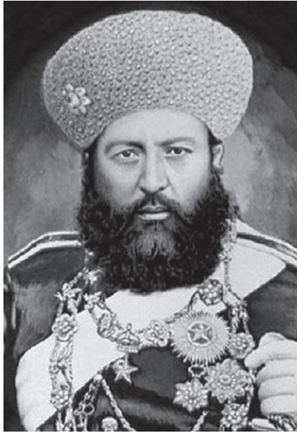
Abdur Rahman Khan, the “Iron Amir,” ruled Afghanistan from 1880 until his death in 1901. During his effort to establish a modern state, his government faced seventeen major rebellions in a fifteen-year period.

quite wearied of the behaviour of these people. They should take with them their families and household property and go out of the country, and I will populate their country with Afghans.” 19