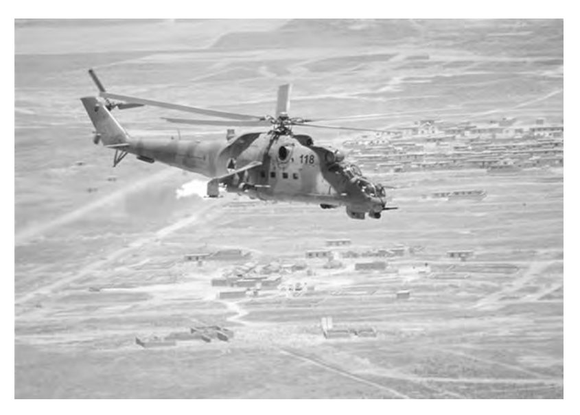
One of the six Afghan Mi-35 Hinds, firing rockets for training, the first known use of rockets by an Afghan helicopter since October 2001.

RELEASED IN A PRISONER EXCHANGE, HE LATER FLEW FOR THE TALIBAN AFTER THEY CAPTURED HIS HOME-TOWN AREA, MAZAR-I-SHARIF